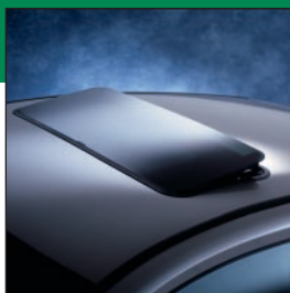
Sunroof panel can be moved to a vent position.