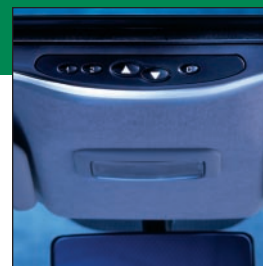
Illuminated, Soft Touch® control panel is easy to use.**

Hollandia 300 power spoiler sunroofs offer quality and innovation for any new vehicle, adding sporty styling and open air freedom. Because of its innovative design, the new Hollandia 300 provides an extremely large opening for even the smallest car or truck. One touch of a button, makes operating your sunroof quick, easy, and safe to use – even at night.