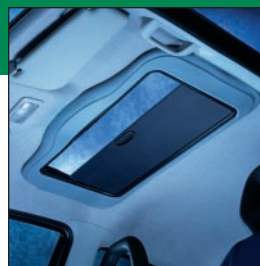
Infinite positioning rolling sunshade gives you the choice of view.**